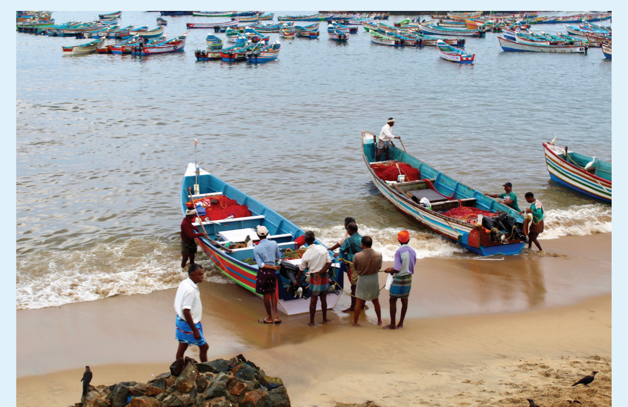
Fig 1: The fishing harbor at Vizhinjam village in Thiruvananthapuram, where fishers from the southern parts of the district launch and land their boats during the monsoon season, when the sea is often rough

On the coast of Thiruvananthapuram district in Kerala state, we selected two fishing villages – Anjengo and Poonthura. We tracked five small (30 – 34 feet) boats in each village and logged their fishing trips for 120 consecutive days, covering the monsoon season of 2018. We compared this data with forecasts, instrument observation of wind and waves, and 20 interviews and eight focus group discussions with local fishers.