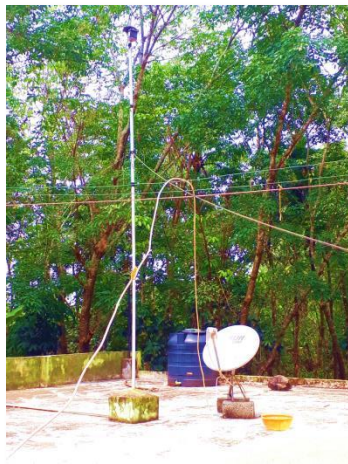
Various marks of damage due to lightning strikes