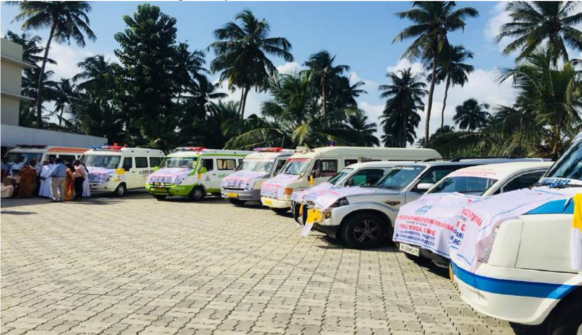
Ambulances of Mobile Clinic at Archbishop’s House, Trichur being ready for action

The project of medical support with Mobile Clinics for the people of the flood affected areas was flagged off by the Mayor of Thrissur at Archbishop’s House Trichur, in the presence of different civil and ecclesiastical dignitaries on 5 th September 2018. The project is conducted with the cooperation of 11 hospitals in the archdiocese, including two medical colleges. Every day 16 mobile clinics are conducted with 8 ambulances. The project plans to cover at least 80 locations for approximately 20,000 affected people. The project is done with the cooperation of the local parish priests, sisters and local panchayath authorities.