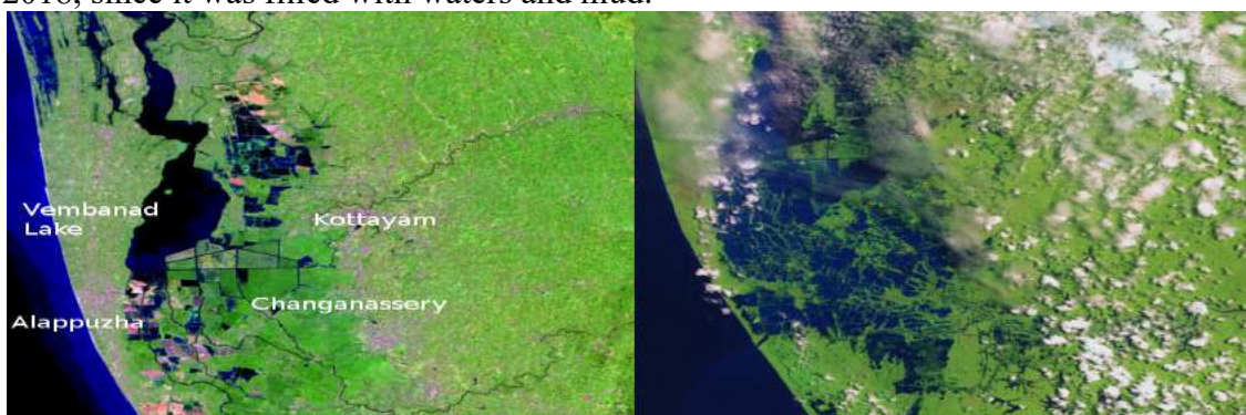
NASA released Satellite image of Kerala before (left) and during flood (right)

2. Floods and Landslides: The flood has been literally devastating to the State, even to the extent of changing the very geographical configuration of the region. Rivers have not only overflowed; some of them have changed their direction too. There were several landslides that washed away the entire families with their houses. All educational Institutions had to be closed down until 29 th August 2018. The transport and communication systems of the State are also ruthlessly affected. The Airport of Cochin had to be closed down until 29 th August 2018, since it was filled with waters and mud.