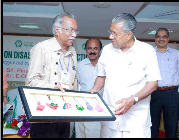
Figure 1 Prof. NVC Menon presenting Chekutty to Hon'ble Chief Minister, Shri. Pinarayi Vijayan

The two-day seminar-cum-exhibition on Disaster Risk Reduction for Nava Keralam, jointly organized by the Kerala State Disaster Management Authority (KSDMA), the United Nations Development Programme (UNDP) and Sphere India, was inaugurated by the Honorable Chief Minister of Kerala, Shri Pinarayi Vijayan in Thiruvananthapuram. The function