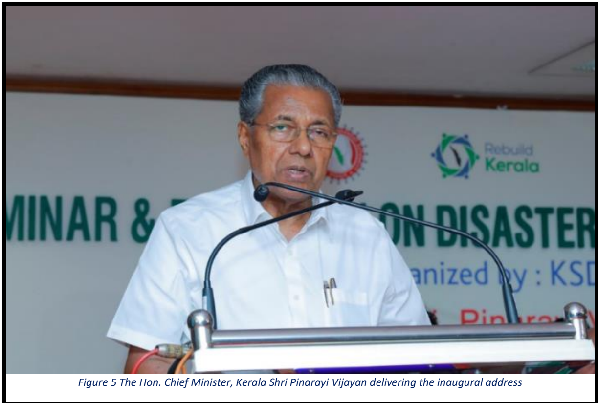
Figure 5 The Hon. Chief Minister, Kerala Shri Pinarayi Vijayan delivering the inaugural address

The Chief Secretary shared that the natural flow of rivers is often prevented by construction activities in river basins. Citing the example of the construction of a bus station in Vazhathoppu, in Idukki District, the Chief Secretary stressed the need for a River Basin Authority. With regard to the rebuilding activities under Nava Keralam, rebuilding cannot be done via a top-down formula, he added. Since the real sufferers