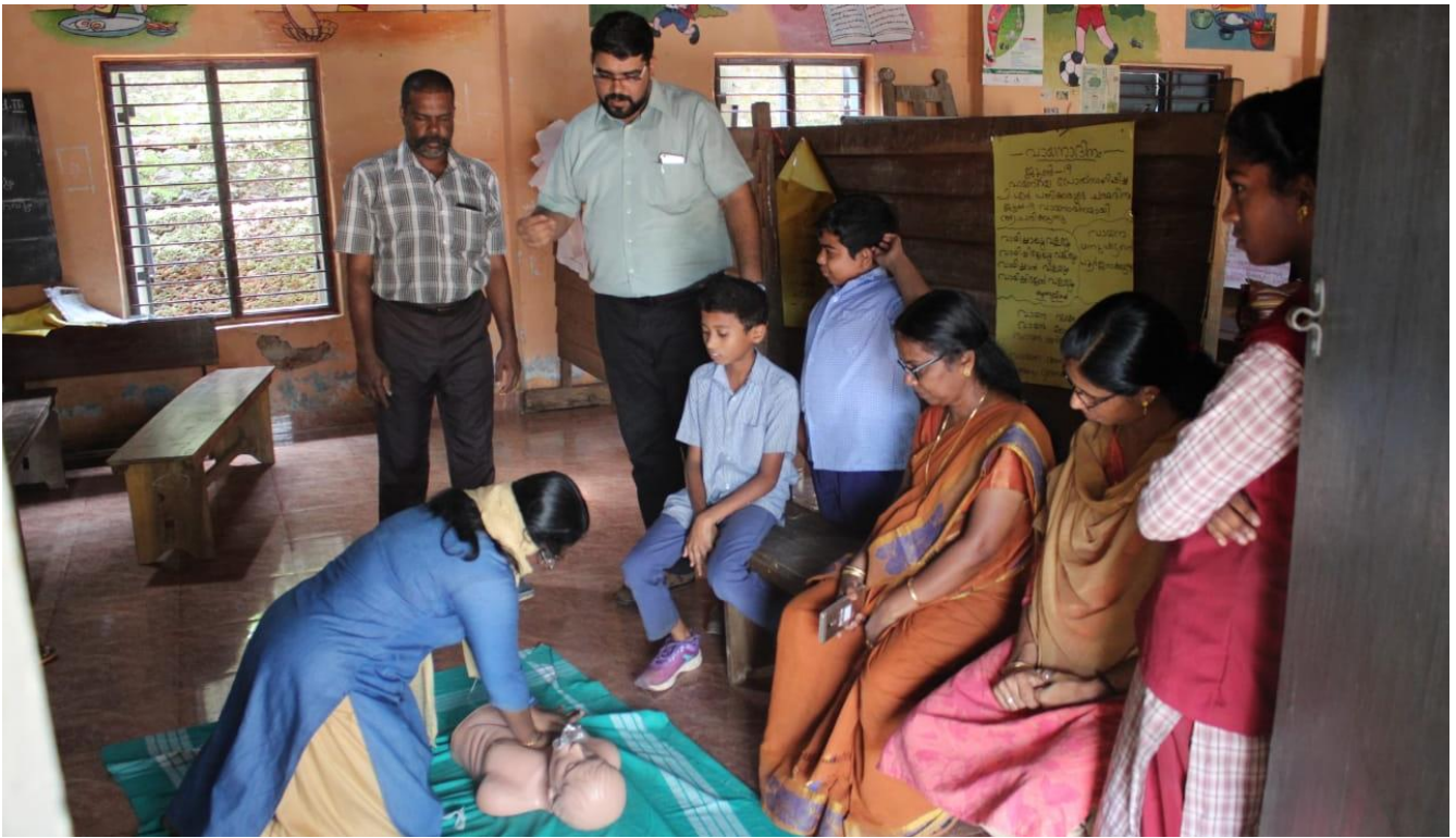
GVHSS ELANTHOOR, PATHANAMTHITTA