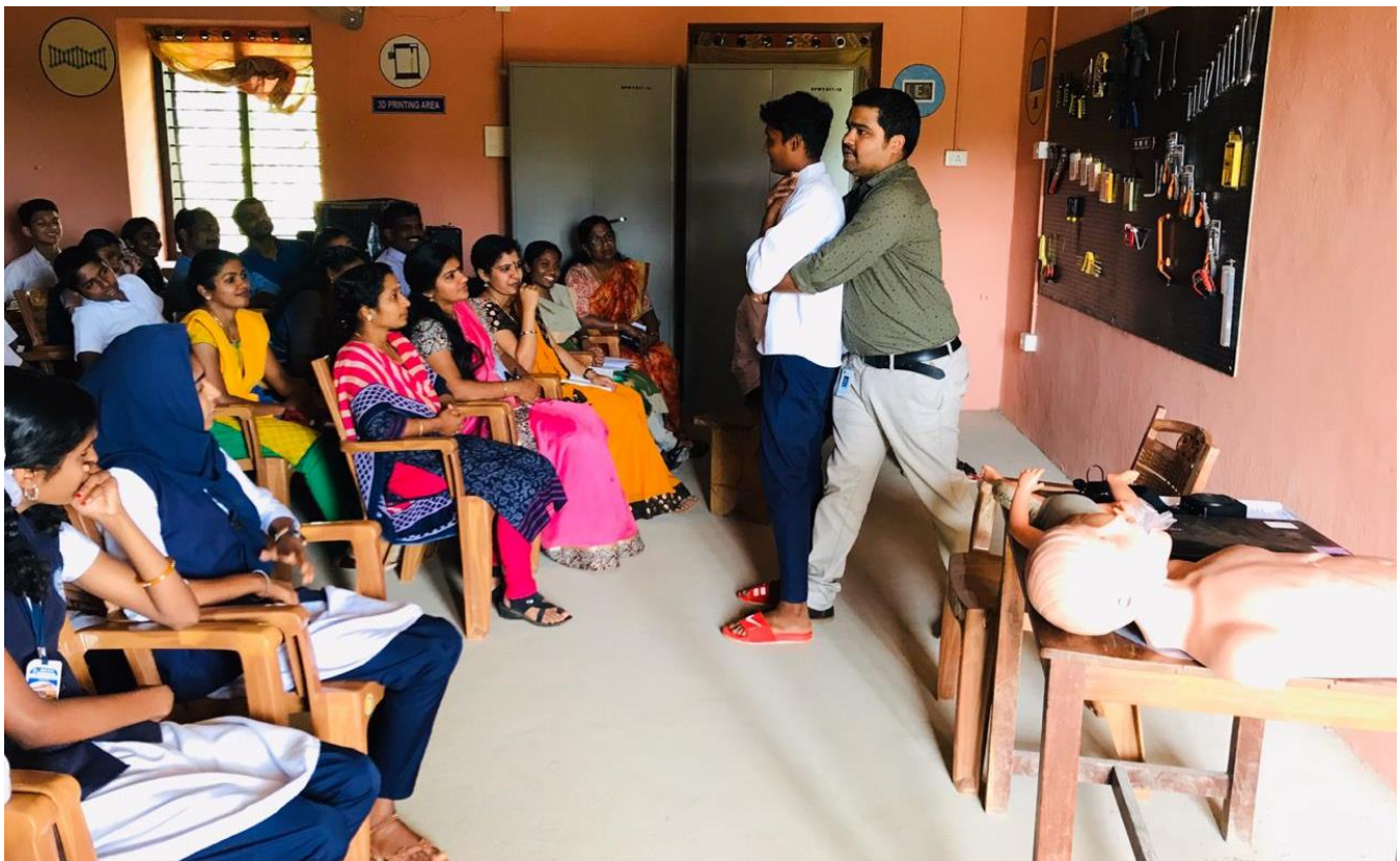
GHS VADUVANCHAL, WAYANAD