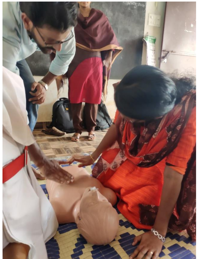
GTUP & HS MUNDERI, MALAPPURAM