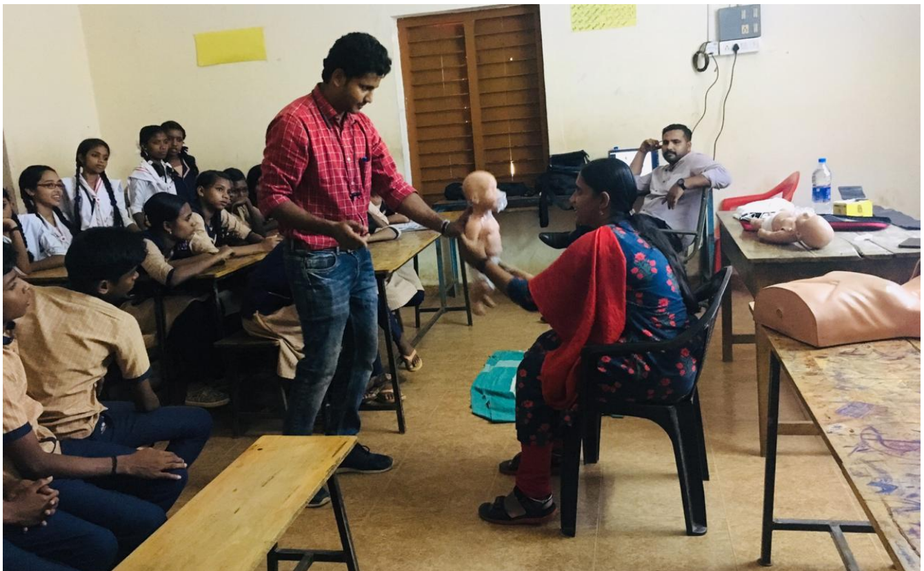
GTWHSS ANAKKAL, PALAKKAD