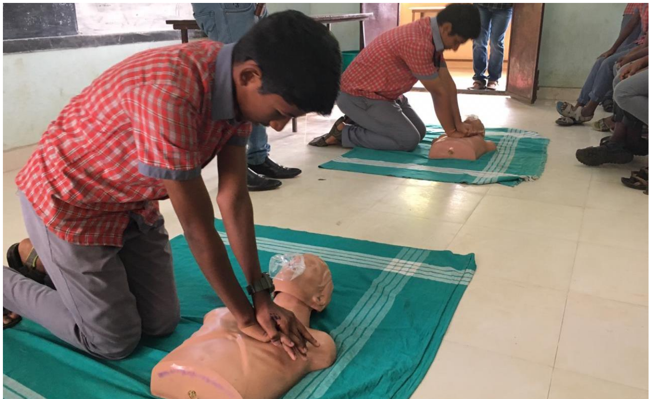
GVHSS KANJIKOD, PALAKKAD