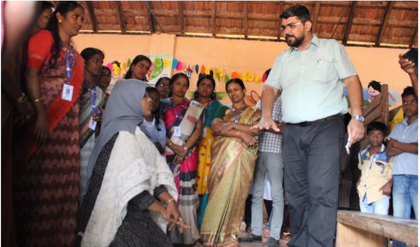
GVHSS ELANTHOOR, PATHANAMTHITTA