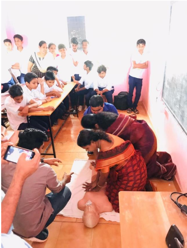
GHS VADUVANCHAL, WAYANAD