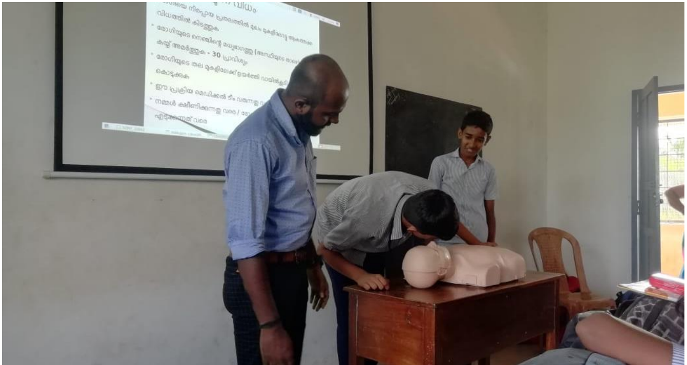
GHSS MUPATHADAM, ERNAKULAM