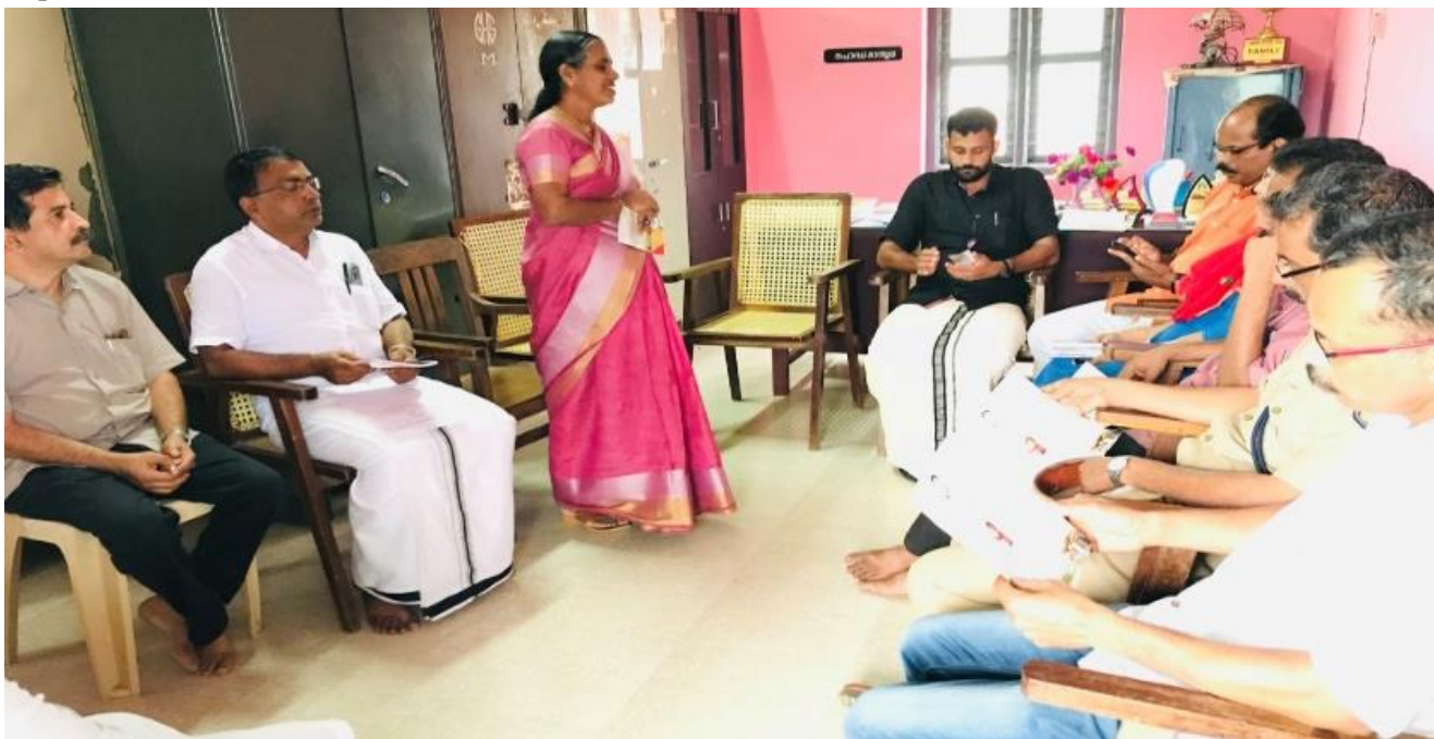
S-ERT formation meeting at GHSS Meppadi, Wayanad district.

School Emergency Response Team (S-ERT) of Basic Life Support is formed in all the 28 schools with a total of 333 members. The purpose of forming School-Emergency Response Team is to equip the school with trained hands to attend to medical emergencies and provide first aid to the injured. Meeting was called by the chairperson on the respective School Disaster Management Committee to discuss the need, importance and scope of constituting S-ERT. In the meeting the Community Mobilisers of the supporting NGO – Foundation for Development Action (FDA), re-introduced the UNDP supported School Safety. In the meeting, the roles and responsibilities of members of S-ERT's was discussed in detail. In meeting it was informed that the members of S-ERT will be trained in first aid skills by and expert training institute – Indian Institute of Emergency Medical Sciences, Kottayam. IIEMS is a training provider affiliated to American Heart Association (AHA) and have vast experience of providing Basic and Advanced Life Support training to a number of stakeholders from government to private sectors.