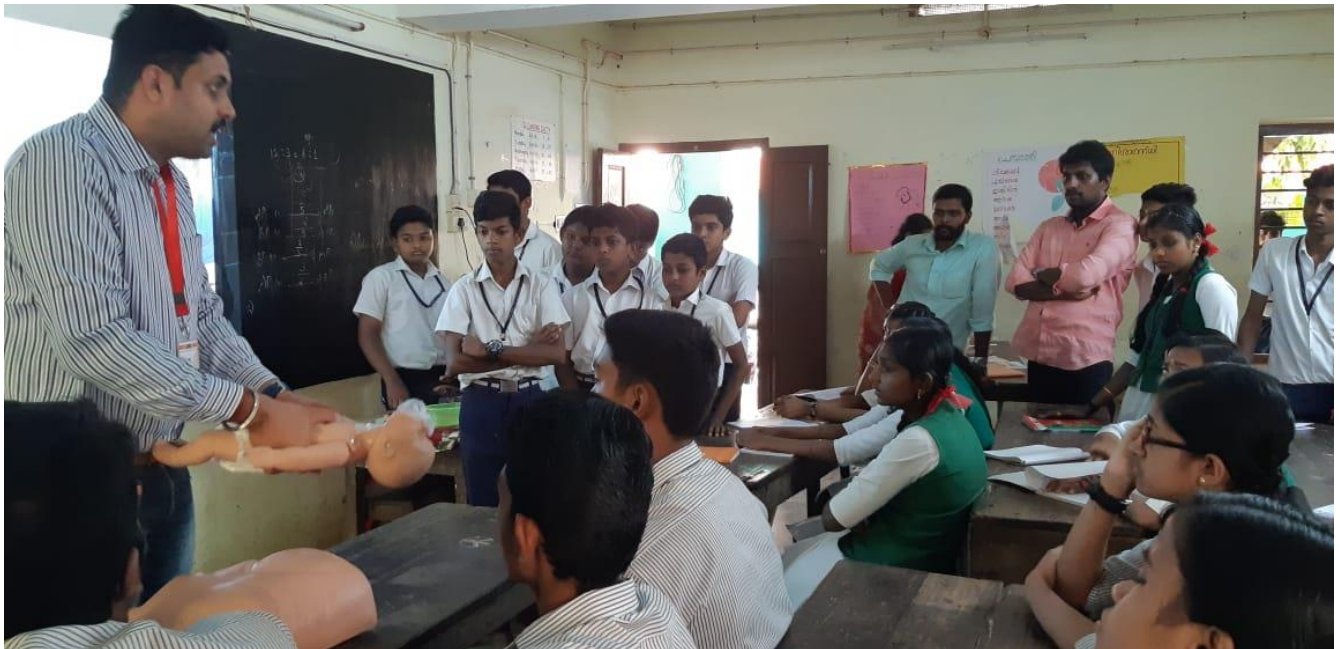
GHSS MADATHARAKANI, THIRUVANANTHAPURAM