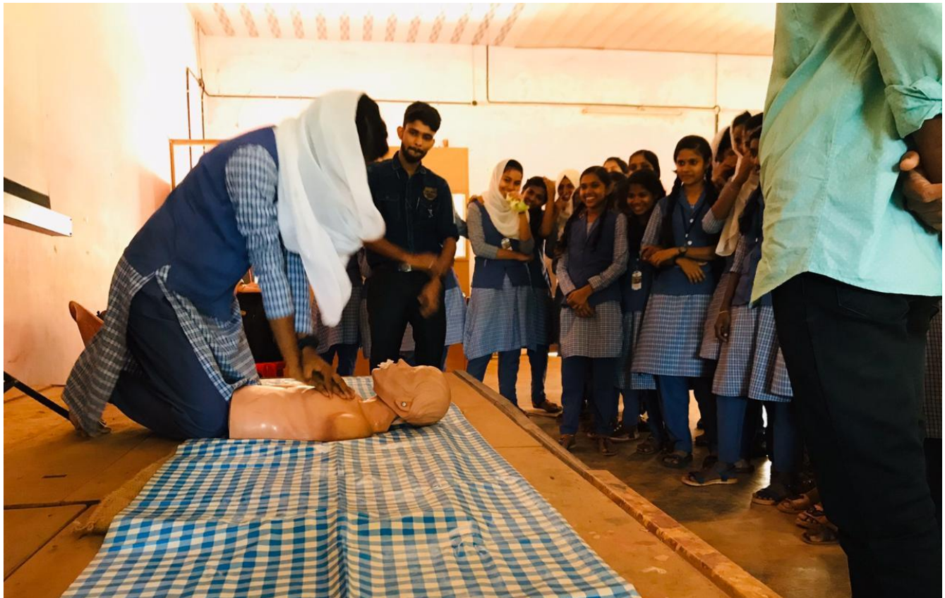
GWHSS CHERUKUNNU, KANNUR