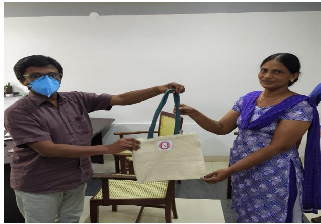
Eco-friendly bag distribution